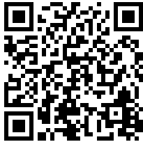
Submit Request for Hearing

Notice: The Official Notice Board (ONB) is still the only official source of information for this regatta.